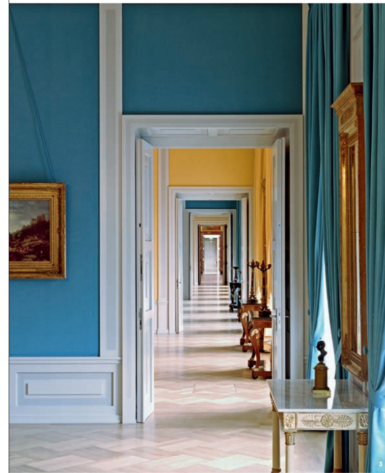
👑 The main rooms are laid out in a long row covering the entire length of the main floor

the majestic ceremonial staircase and stately Knights' Hall. Today, the restored grand rooms of the belétage (main floor) are furnished with over 800 exhibits, including 21 large tapestries . Alongside these tapestries, the richly ornamented furniture, precious paintings, opulent porcelain pieces and silver objects bring the historic royal splendor to life.