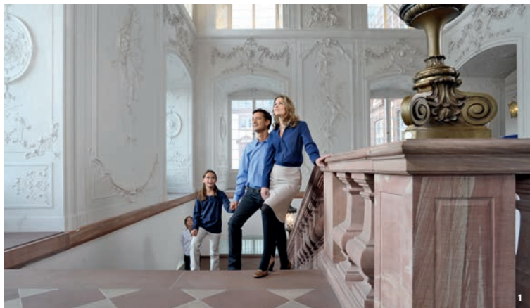
👑 An impressive sight: the grand main staircase

himself with leading artists and musicians, making Mannheim a Musenhof , a place known for its circle of luminaries. Among the illustrious visitors in the 18th century was Wolfgang Amadeus Mozart.