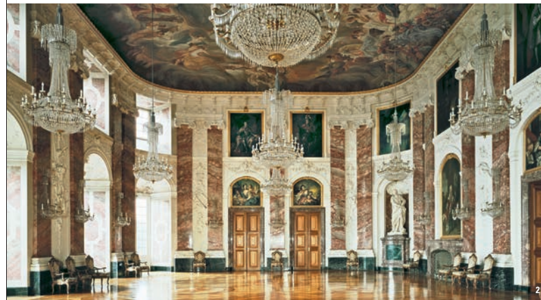
👑 Mannheim's grandest room: the Knights' Hall

The historic interior decor, in particular that of the main floor, was praised from the beginning and is of European renown. However, the building was severely damaged during the Second World War. Since then, the main part of the palace has been rebuilt, including