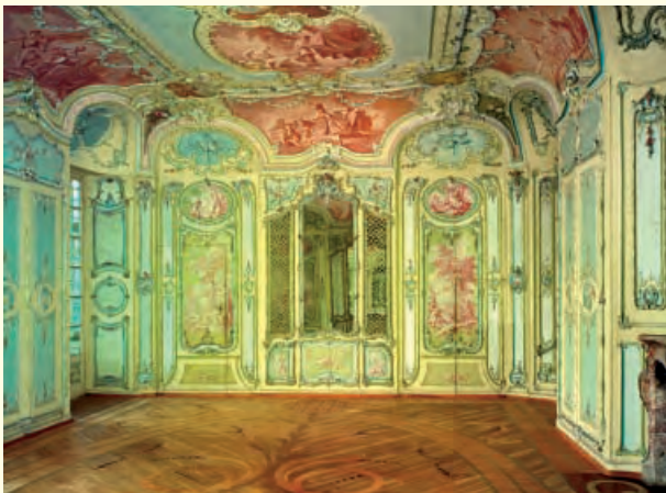
Cabinet Library of the electoral princess

Grand Duchess Stéphanie of Baden, Napoléon's adoptive daughter, modernised the interior of the palace primarily in accordance with the neoclassical Empire style. Mannheim remained the dowager residence of this influential princess, who maintained relations with many of the ruling houses of Europe up to her death in 1860.